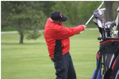
After School Program